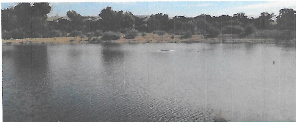
AMWC's NWP recharge pond at capacity.